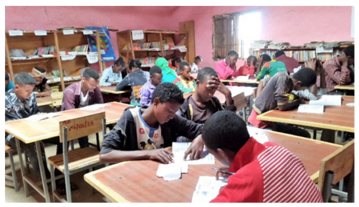
H2 Empower contributed many books to the library.

This school was the most impoverished in Hosanna Town, serving the most marginalized students, when we first came in 2003. Today it has grown to include many more school buildings, a lovely library, and has added a public secondary school to serve its students who would have to walk very far to get to the secondary school. H2 Empower provided most of the books in this library as well as other materials.